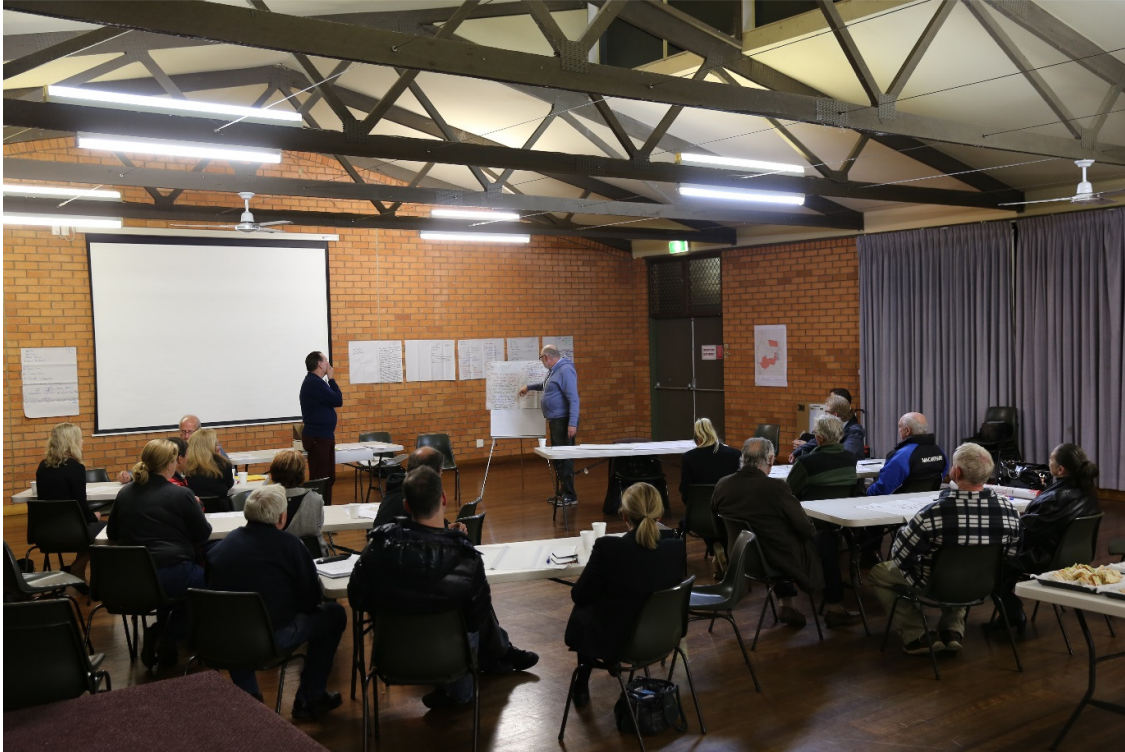
Figure 1: Photo of Workshop in action - 10 June 2015

Subsequently the proponents (applicants) for each of the Appin planning proposals were informed of the event and advised that depending on the issues that arose from the initial workshop, Council may wish to invite them a further workshop.