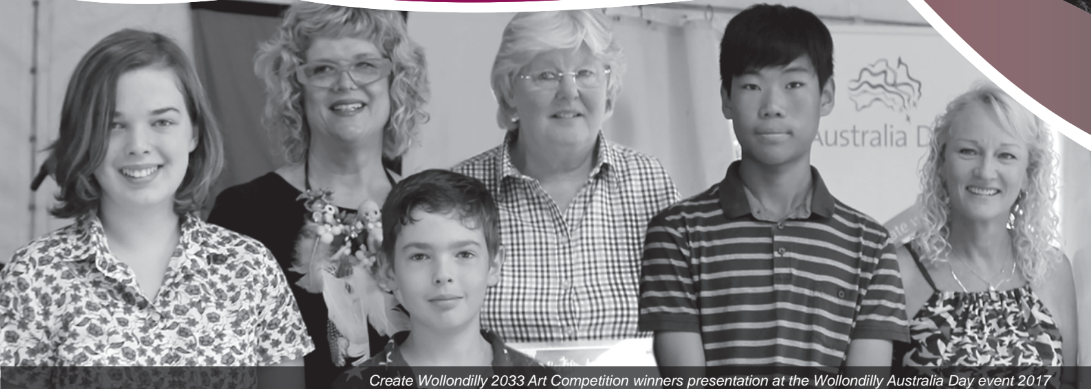
Create Wollondilly 2033 Art Competition winners presentation at the Wollondilly Australia Day event 2017