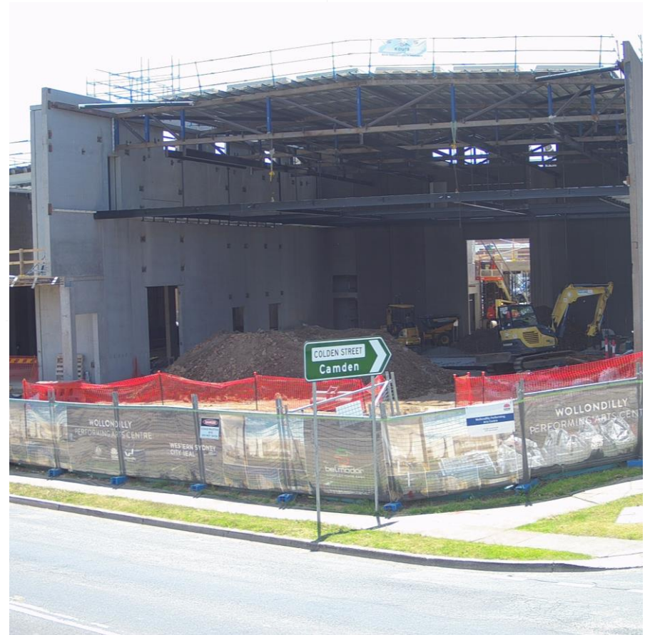
Main Theatre Space at end of October 2023.