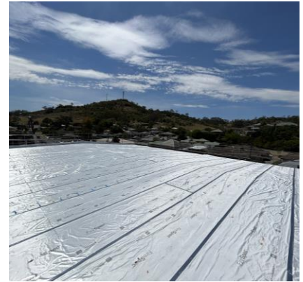
Structural Steel, Lower Roof and Theatre Roof