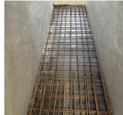
Orchestra Pit, Precast Works, OSD Tank, Stair 2 Flight