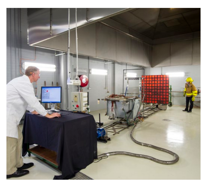
Testing on a small scale for radiant heat exposure for building materials. CSIRO, Clayton site, Victoria.

We conduct laboratory testing and assessment of materials, elements of construction and systems in accordance with Australian requirements for the construction of buildings in bushfire prone areas. We also provide large scale evaluations for buildings exposed to radiant heat and large flaming sources for bushfire attack levels up to the flame zone.