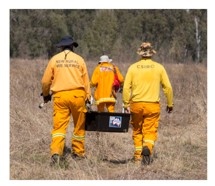
Working with other agencies to study bushfire behaviour at lpswich in 2017.

Whether it's state fire agencies, Traditional Owners, government, business or a community in need, we are here to help. We apply cutting edge science and technology to deliver material benefit to Australian communities.