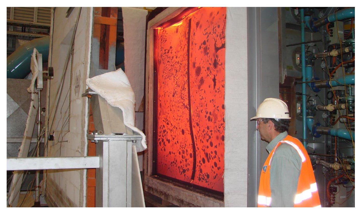
Large scale AS1530.8 test for buildings exposed to bushfire attack (radiant heat) at CSIRO, North Ryde site, NSW.