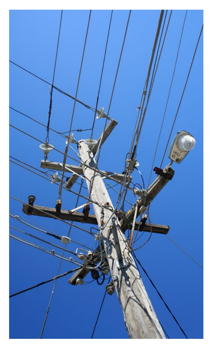
Using big data to reduce the risk of fires from powerlines.