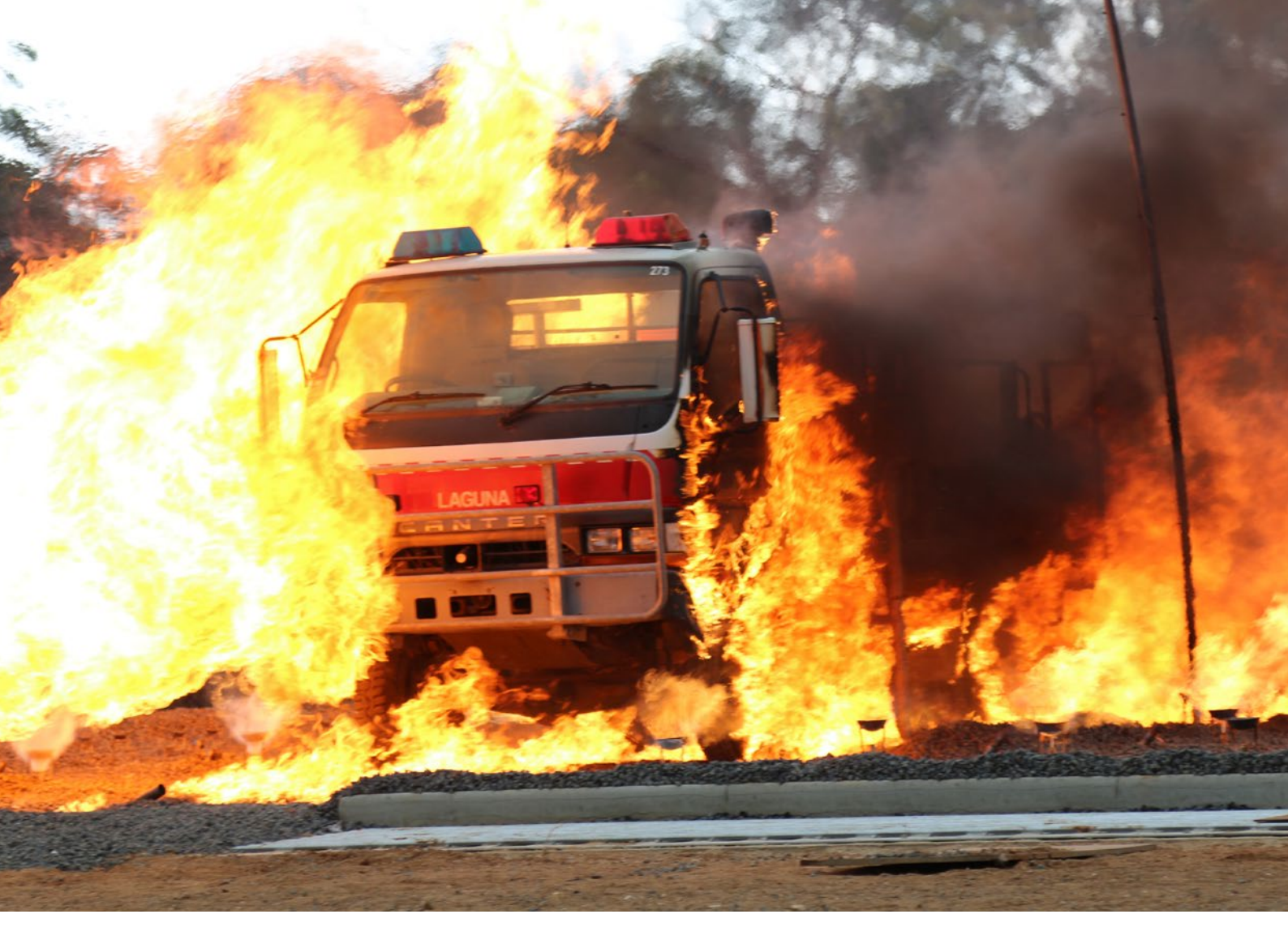
CSIRO testing of firefighting vehicles to support development of crew protection systems.