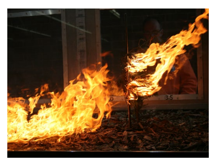
Experimental fire in CSIRO's Pyrotron. Scientists study ignition shrub fuels from surface fire.