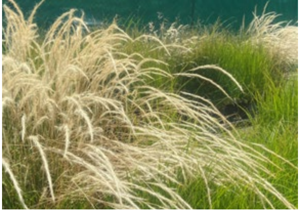
Native grasses at the nursery.

Each voucher can be redeemed for 5 plants per quarter. Plant stocks at the nursery vary seasonally throughout the year so it is always worth coming back for that special plant you haven't seen before.