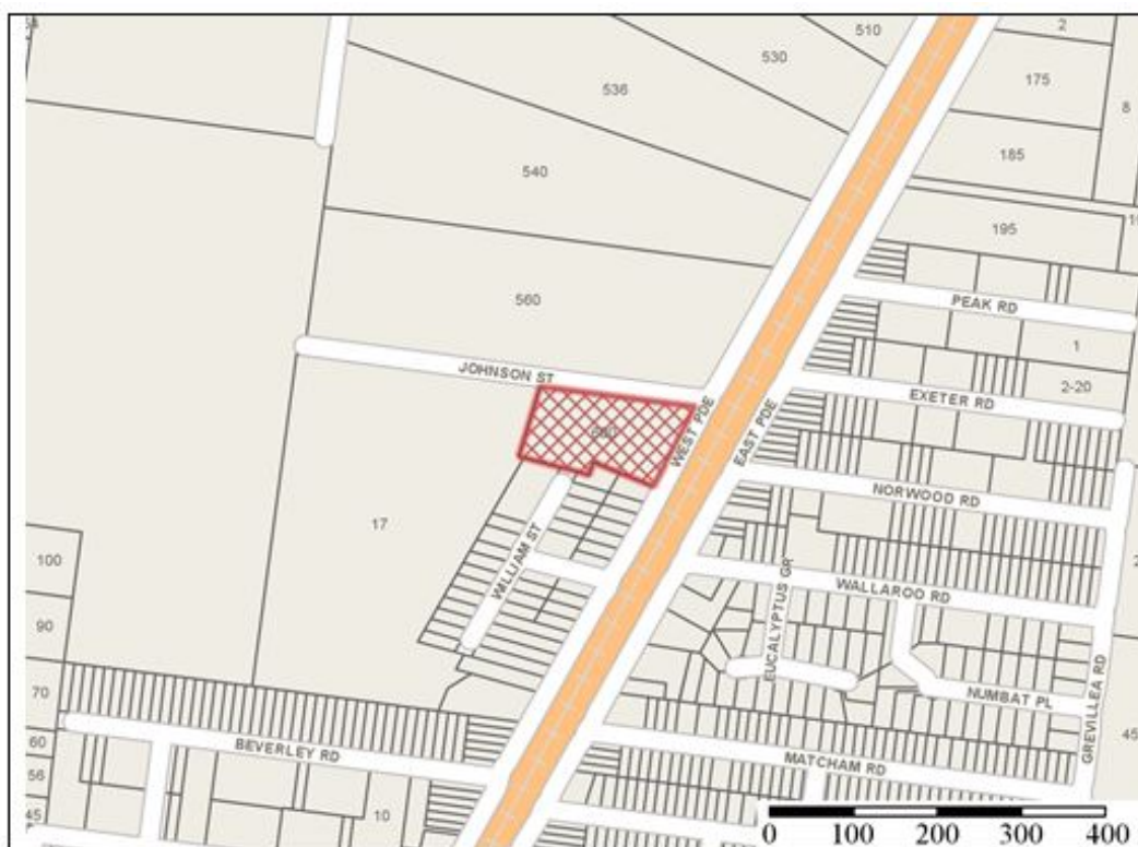
LOCATION MAP ↑ N