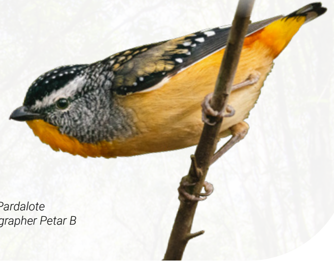
Spotted Pardalote