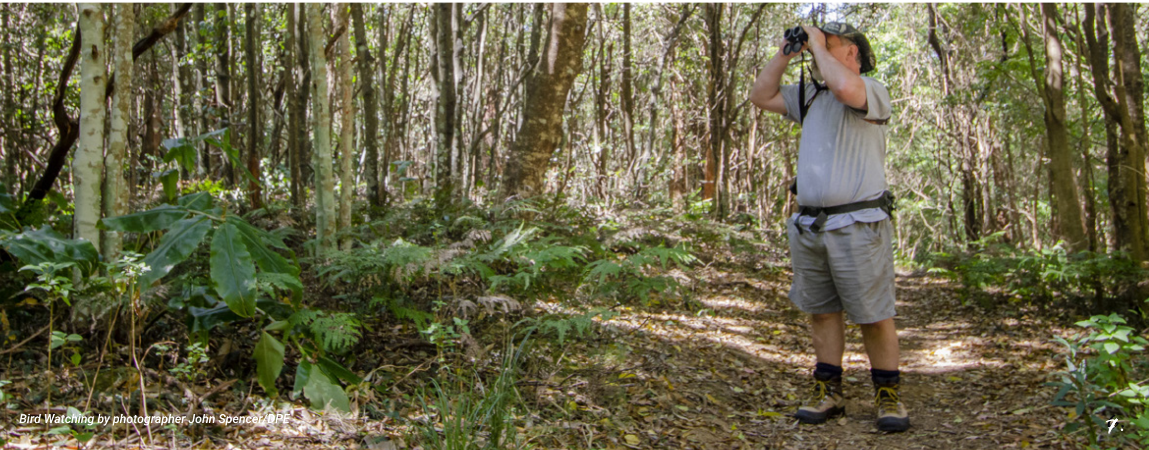
Bird Watching