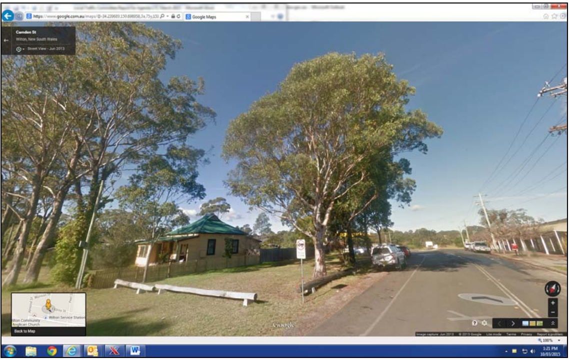
Camden Street Looking South