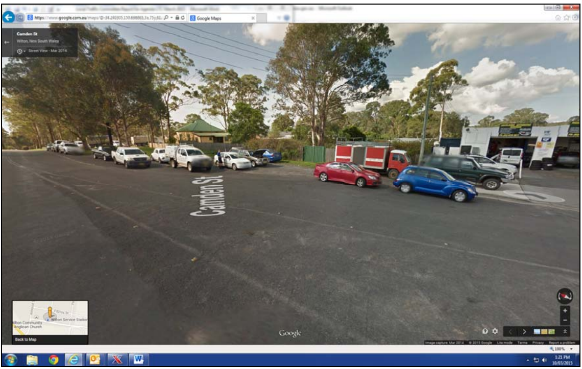
Camden Street looking North