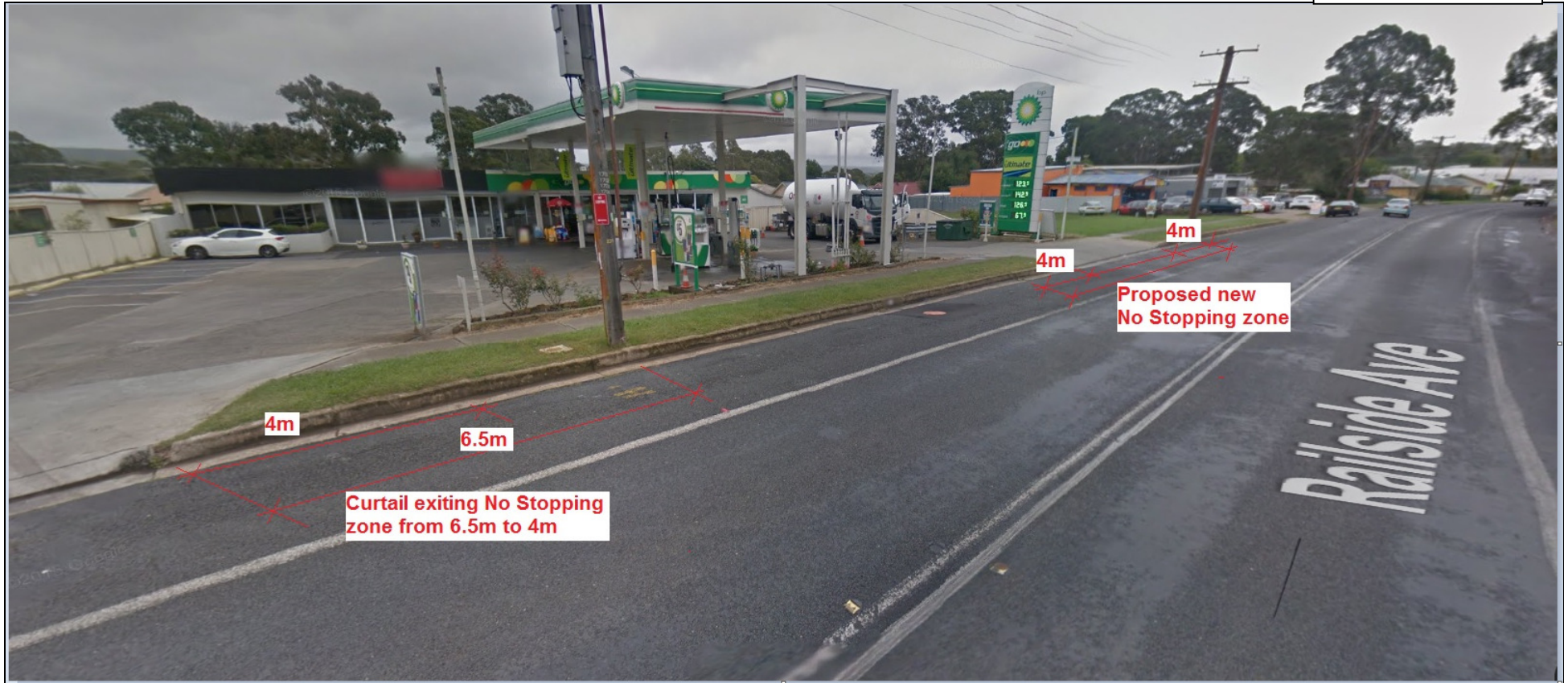
Proposed No Stopping (R5-400) Zone at the BP Service Station, Railside Avenue, Bargo.