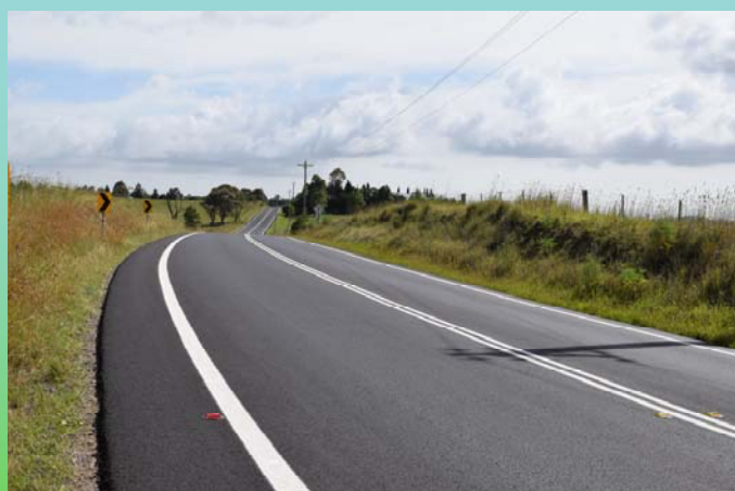
Montpelier Dr Blackspot