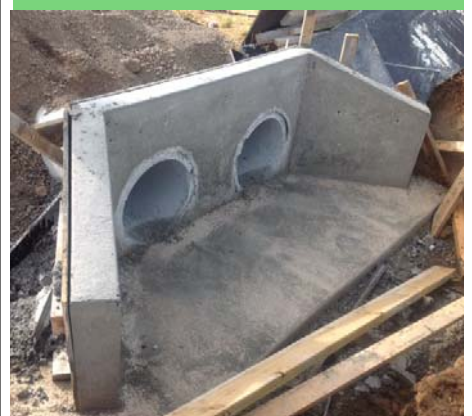
Spring Creek Rd Drainage