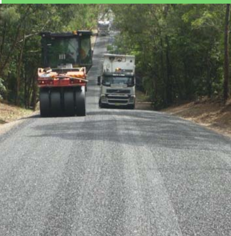
Skarrats Lane Sealing

Shire Library Renovation - Council's contractor commenced renovation of the Library building in October and the project is progressing well. The internal strip-out is complete and services are being installed.