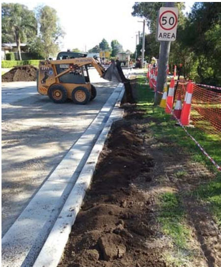
Castlereagh St Kerb & Gutter