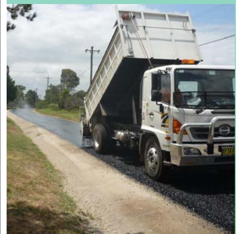
Old Oaks Rd Sealing