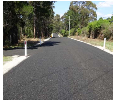
East St Sealing

Lisa Rd, Wilton - Heavy patching works were carried out in December ahead of planned road reconstruction which is scheduled for early 2016.