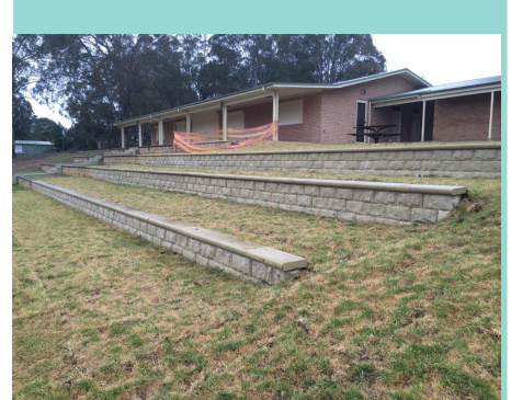
Douglas Park Sportsground Terracing

Remembrance Dwy Razorback Rockfall Site - The hired concrete barriers were replaced in September with more suitable permanent barriers which include a rock catch screen to prevent bouncing rocks from entering the travel lanes. Council will continue to monitor the condition of the rock face as well as traffic capacity issues.