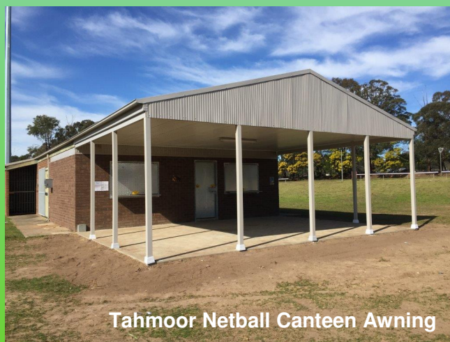
Tahmoor Netball Canteen Awning