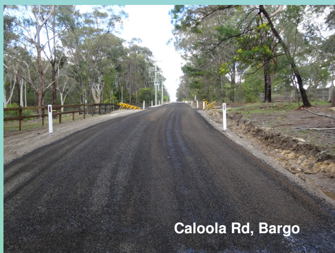
Caloola Rd, Bargo