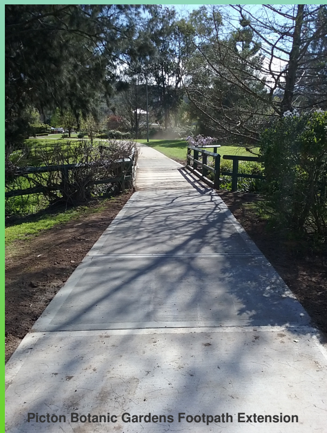
Picton Botanic Gardens Footpath Extension