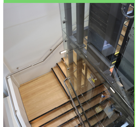
Picton Library Refurbishment