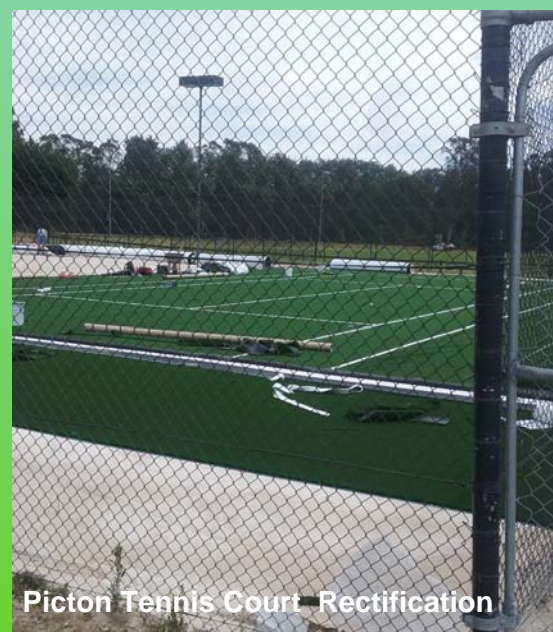
Picton Tennis Court Rectification