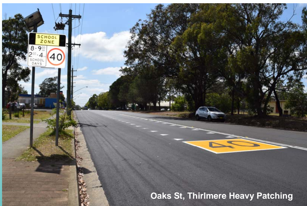
Oaks St, Thirlmere Heavy Patching