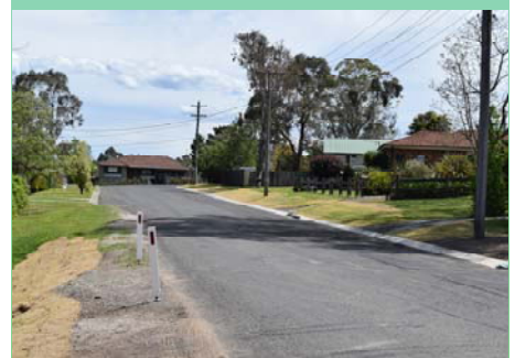
Moorland Rd K&G Tahmoor