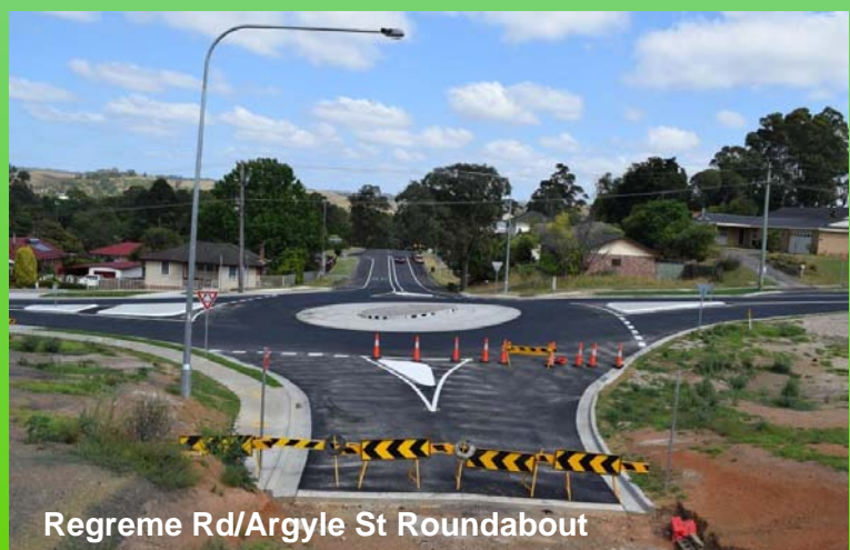
Regreme Rd/Argyle St Roundabout