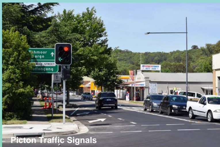
Picton Traffic Signals