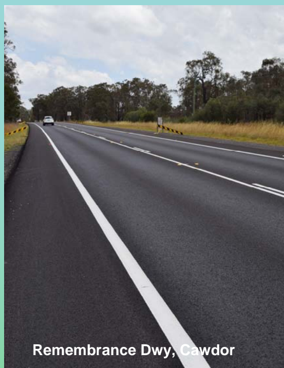
Remembrance Dwy, Cawdor