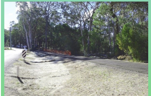
Denmead St, Thirlmere