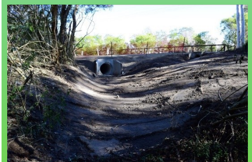
Denmead St, Thirlmere