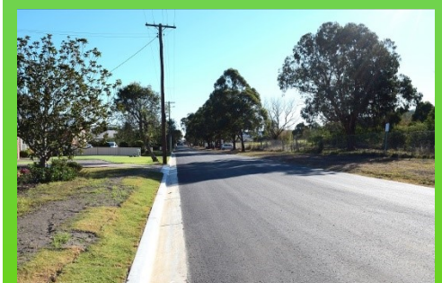
Station St, Douglas Park