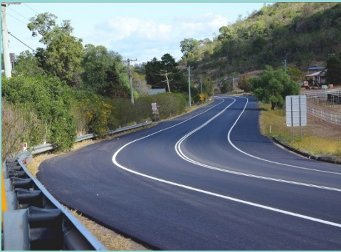
Remembrance Drwy, Razorback