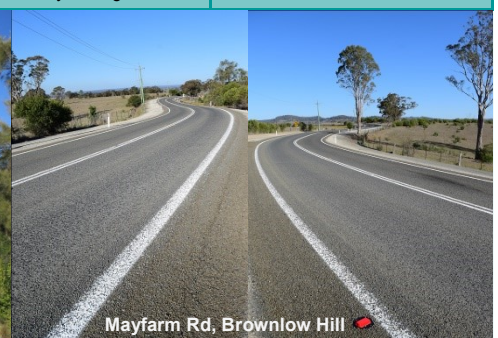
Mayfarm Rd, Brownlow Hill