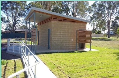
Bargo Accessible Amenities

This work has been completed to improve safety of roads in our Shire.