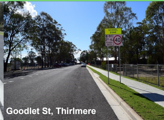
Goodlet St, Thirlmere