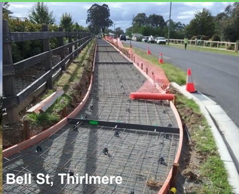
Bell St, Thirlmere