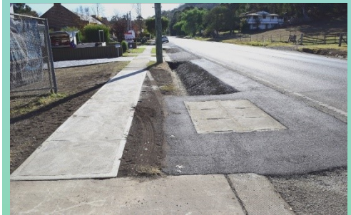
Menangle St, Picton, Western Drainage Pit