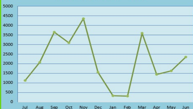
Pot hole repairs 2017 - 2018

Council operates a truck to undertake repairs on Council's extensive road network. This machine is purpose built to fill potholes, correct road surface defects and respond to maintenance requests. It is often a temporary solution until Council has the resources to address the failures permanently.