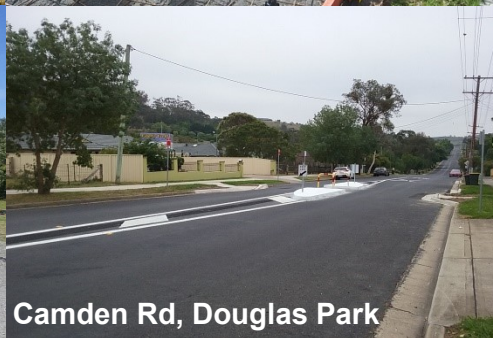
Camden Rd, Douglas Park