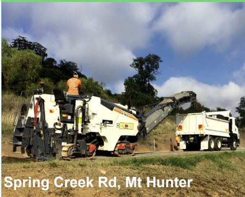
Spring Creek Rd, Mt Hunter

The Transport Program Update can also be found here, This update provides a synopsis of some of the recently completed projects