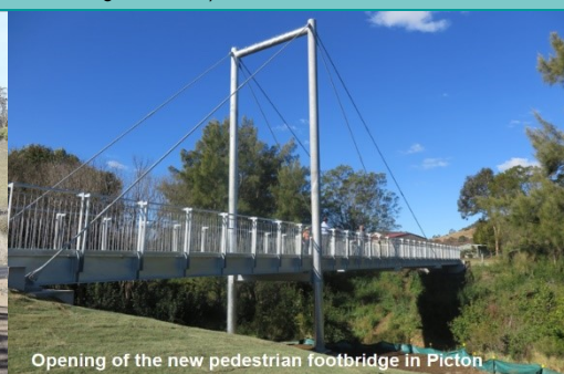
Opening of the new pedestrian footbridge in Picton