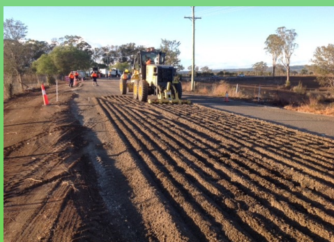
Mayfarm Rd, Brownlow Hill

The team focused on small scale patching of failures on busy Council roads including Menangle Rd, Thirlmere Way, Werombi Rd, West Parade, Mt Hercules Rd and Montpelier Dr.