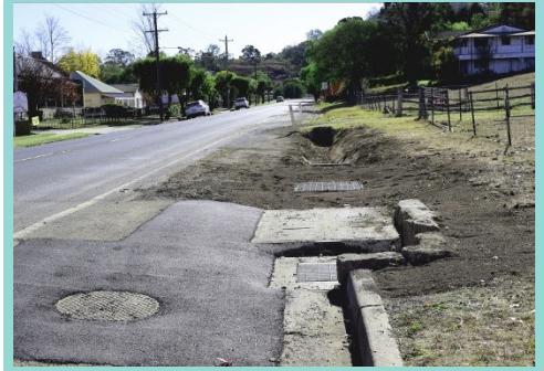
Menangle St, Picton, Eastern Drainage Pit