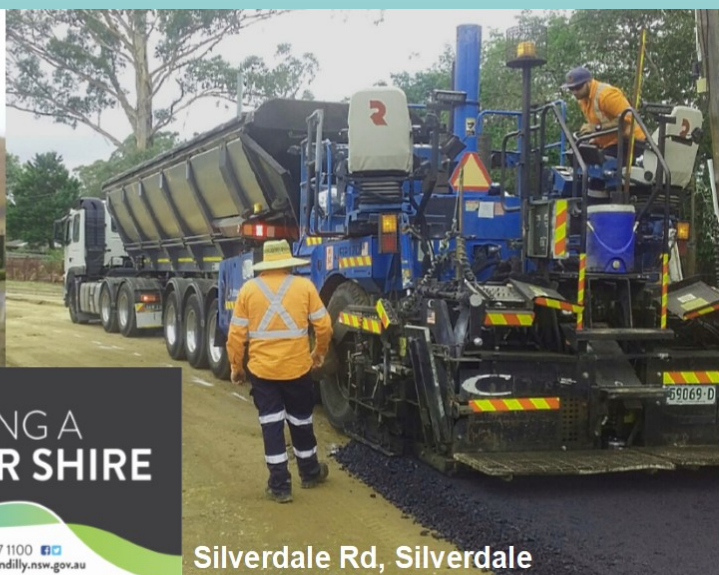
Silverdale Rd, Silverdale