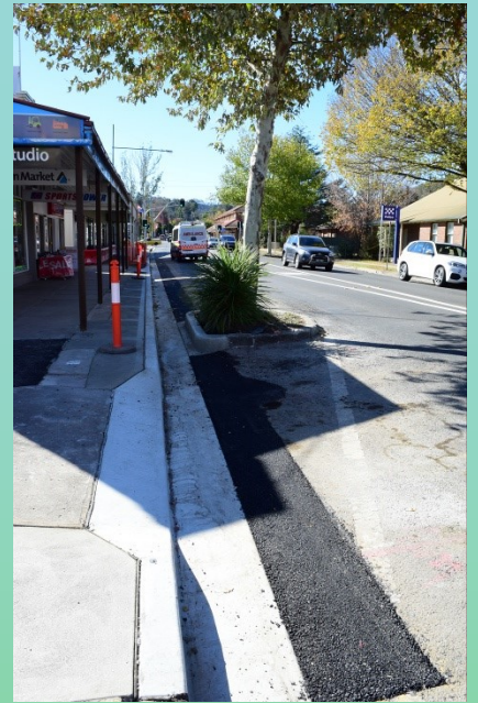
Montpelier Drwy, The Oaks (Blackspot funding)