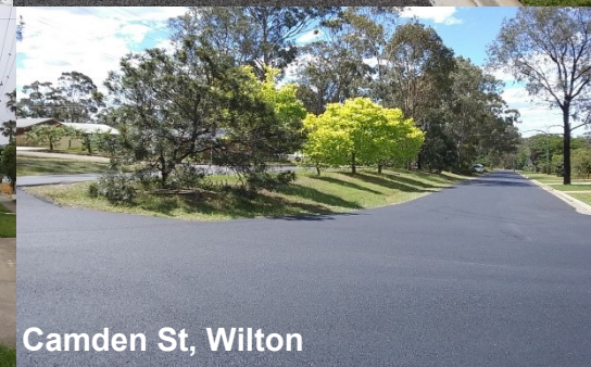
Camden St, Wilton