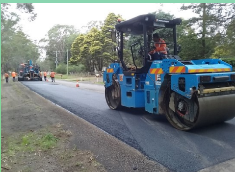
Burraborang Rd, Belimbla Park

Other significant reconstruction works this year included, Remembrance Dr, Tahmoor between Rockford Rd to Stratford Rd. Additionally, roadworks were completed at Spring Creek Rd Mt Hunter, Werombi Rd @ Mount Hunter Rivulet, Brownlow Hill and Avon Dam Rd, Bargo.