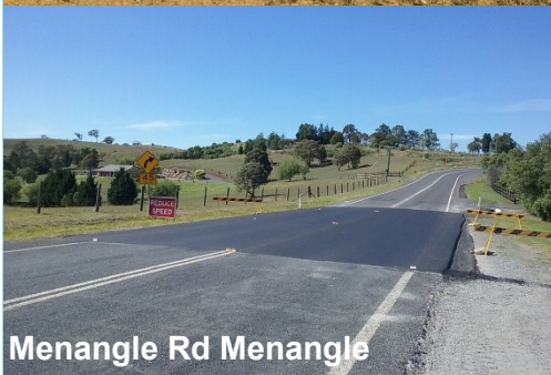
Menangle Rd Menangle