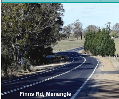
Finns Rd, Menangle