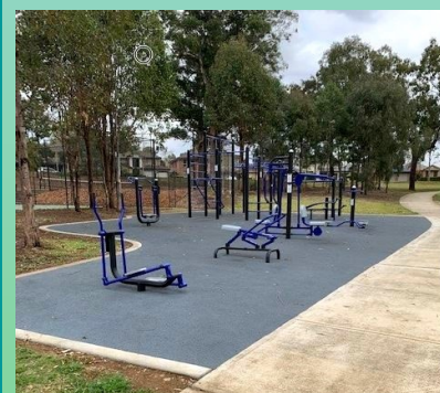
Cubbitch Barta Reserve