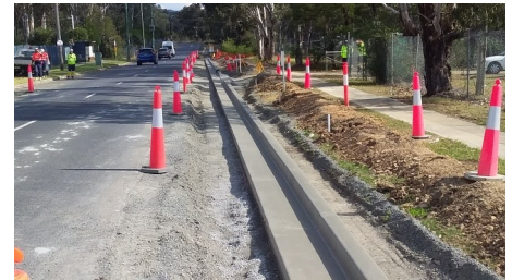
Tylers Rd, Bargo

Cubbitch Barta Reserve, Camden Park - Installation of a new multi purpose court.