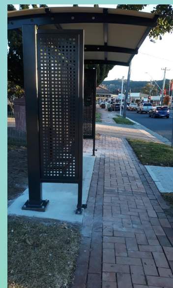
Argyle St, Picton Bus Shelter