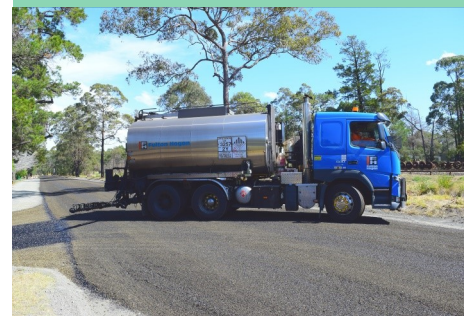
Station St, Thirlmere