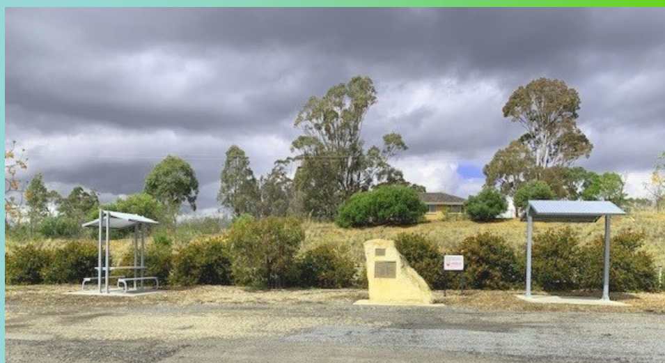
Razorback Truck Memorial