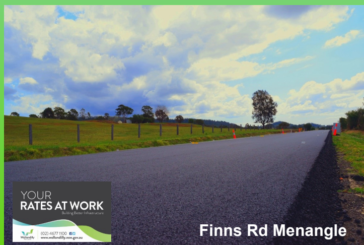
Finns Rd Menangle