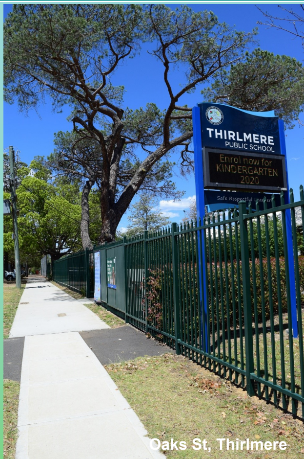
Oaks St, Thirlmere