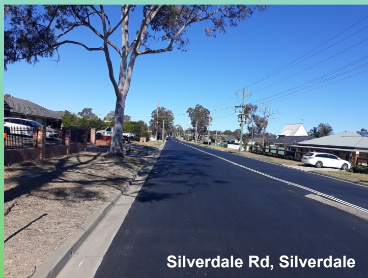
Silverdale Rd, Silverdale