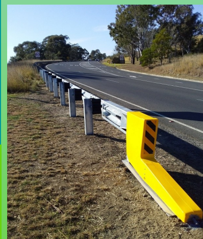
Remembrance Drwy, Picton