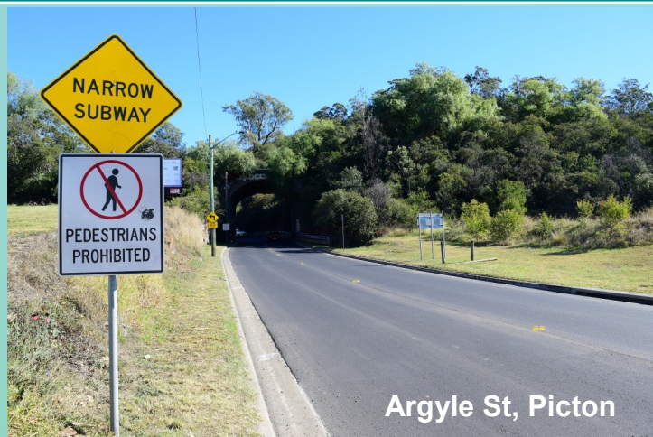
Argyle St, Picton