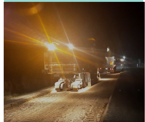
Woodbridge Rd, Menangle