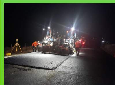
Woodbridge Rd, Menangle