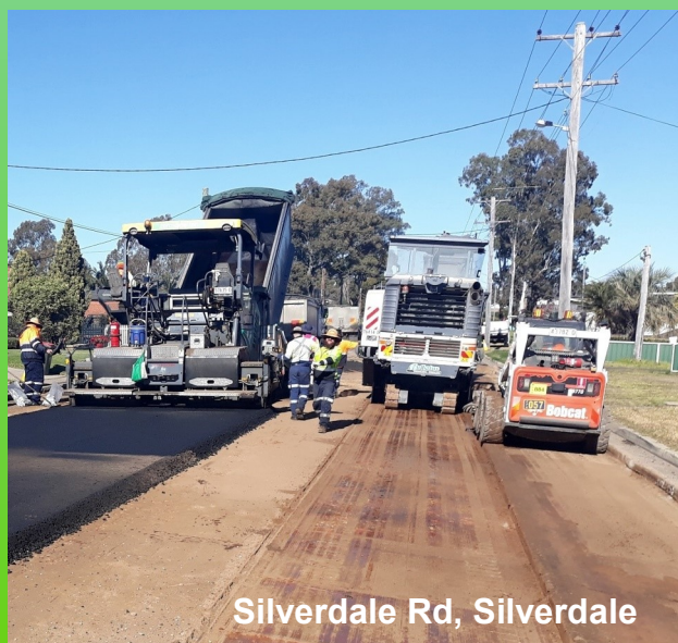
Silverdale Rd, Silverdale