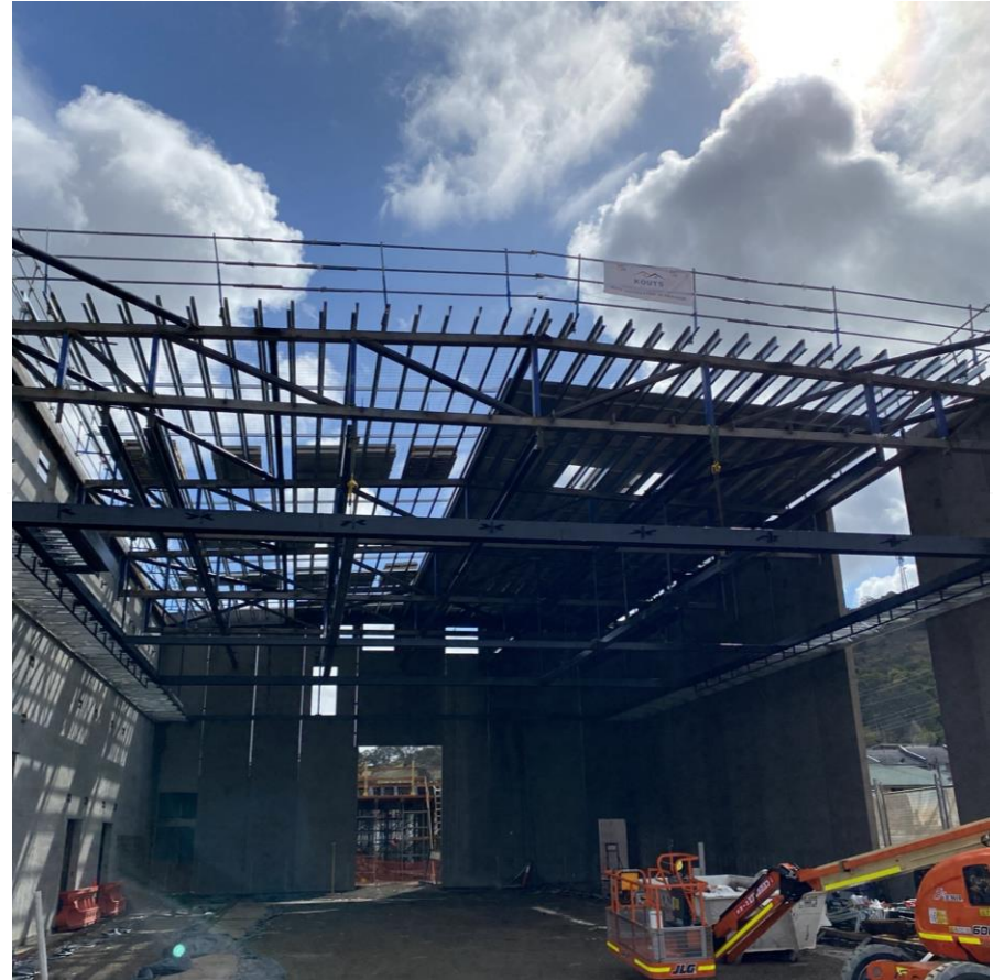
Main Theatre Space at end of September 2023.