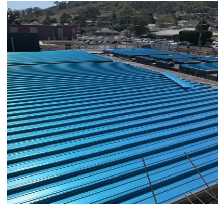
Waterproof Retaining Wall, Form Reinforce & Pour Level 2 Pour 2 Slab