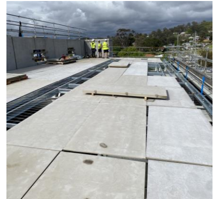
Clear Front of House Area, Install of Structural Steel, Commence Roofing