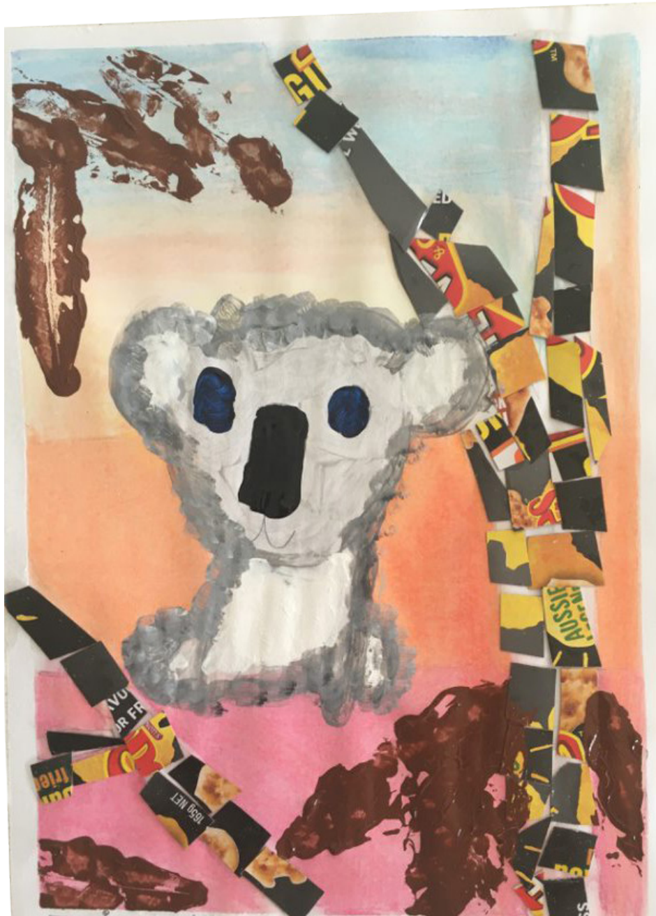
Evie (waste to art) koala

The Macarthur region, our backyard, is home to a wide diversity of native plants and animals. Many of these plants and animals are affected by a range of impacts such as habitat loss, competition and predation from non-native species and foreign diseases. There are a range of species occurring within the local region that are at risk of extinction and have been listed as 'Threatened Species.'