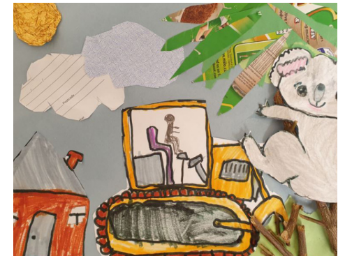
Khadijah, (waste to art) highly commended