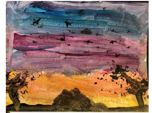
Eloise, 5-6 years 3rd place, Grey-headed Flying Fox at dusk