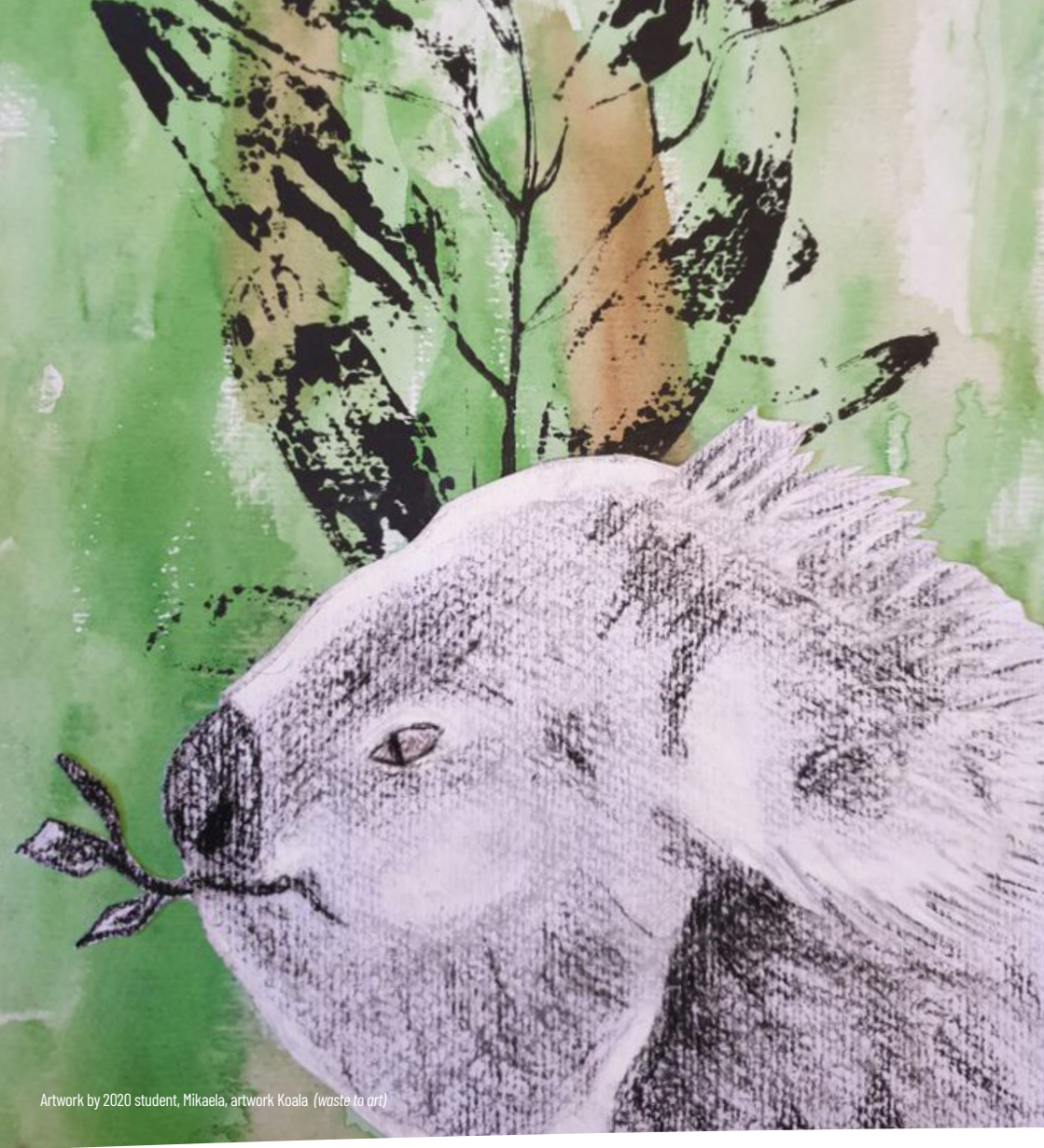
Artwork by 2020 student, Mikaela, artwork Koala (waste to art)