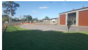
Landscape plants and turf