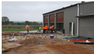
Pouring the driveways