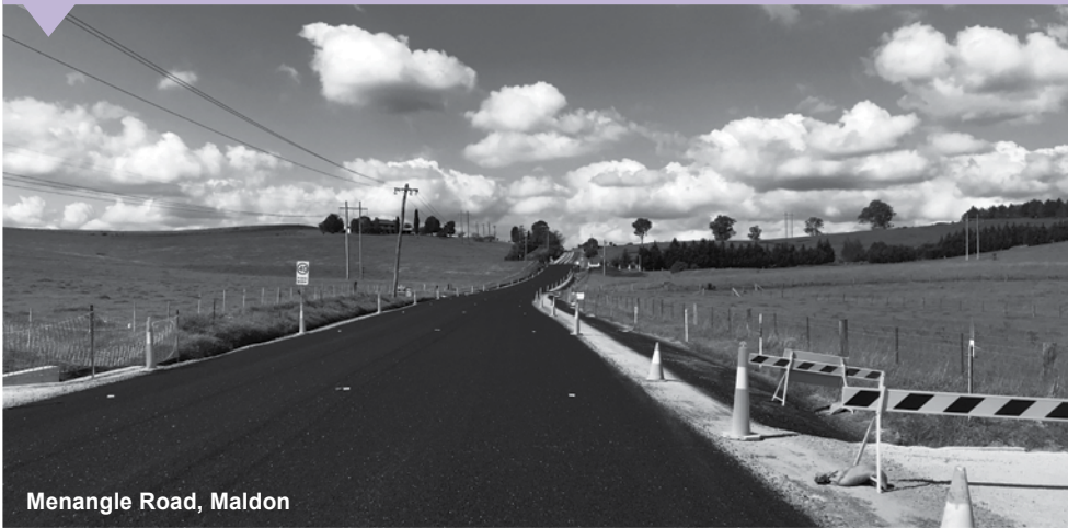
Menangle Road, Maldon

In addition to larger projects, the crews continue to work consistently on smaller maintenance jobs across the Shire's extensive road network. In the last six months this maintenance has included drainage work, unsealed road grading, re-linemarking roads, patching potholes and heavy patching of road failures.