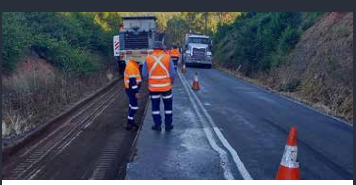
ROADWORKS AT THIRLMERE WAY