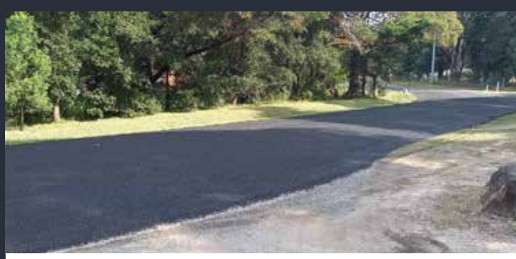
SURFACE SEALING ON BINALONG ROAD TO PREVENT ROAD DETERIORATION