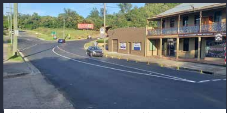
WORKS COMPLETED AT BARKERS LODGE ROAD AND ARGYLE STREET