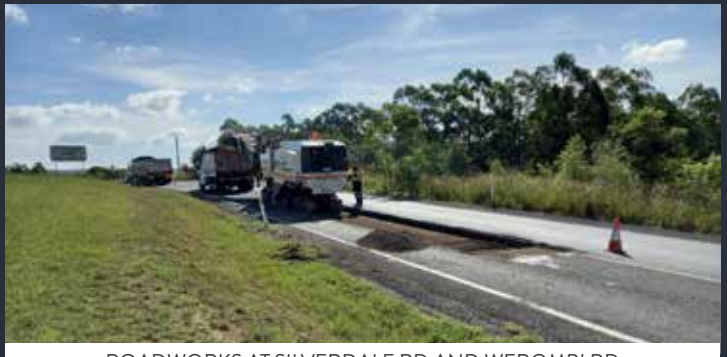
ROADWORKS AT SILVERDALE RD AND WEROMBI RD

HERE ARE A FEW HIGHLIGHTS OF WHAT OUR TEAMS HAVE DONE IN THE LAST FEW MONTHS