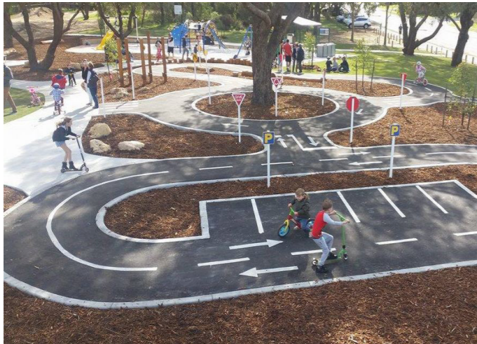
Shepherds Bush Park, Kingsley Perth WA