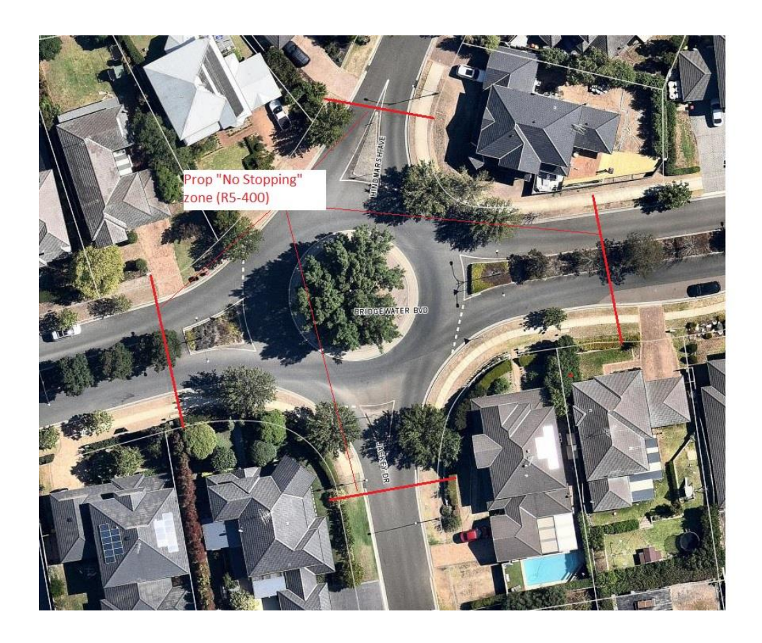
Site Map of the proposed "No Stopping" zone (R5-400)