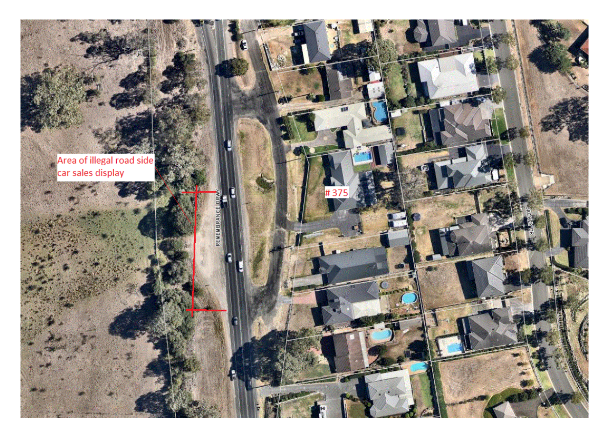
Locality aerial view