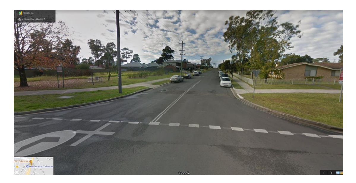
Looking east into Progress St from Remembrance Driveway