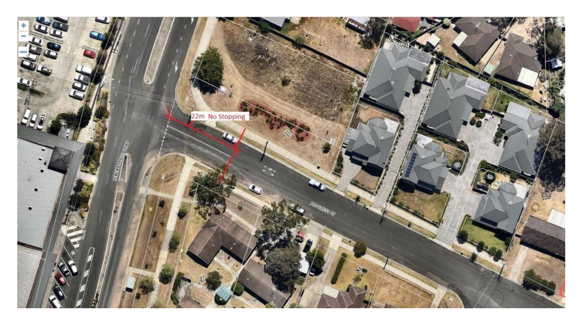
Site Map of the proposed "No Stopping" zone (R5-400).