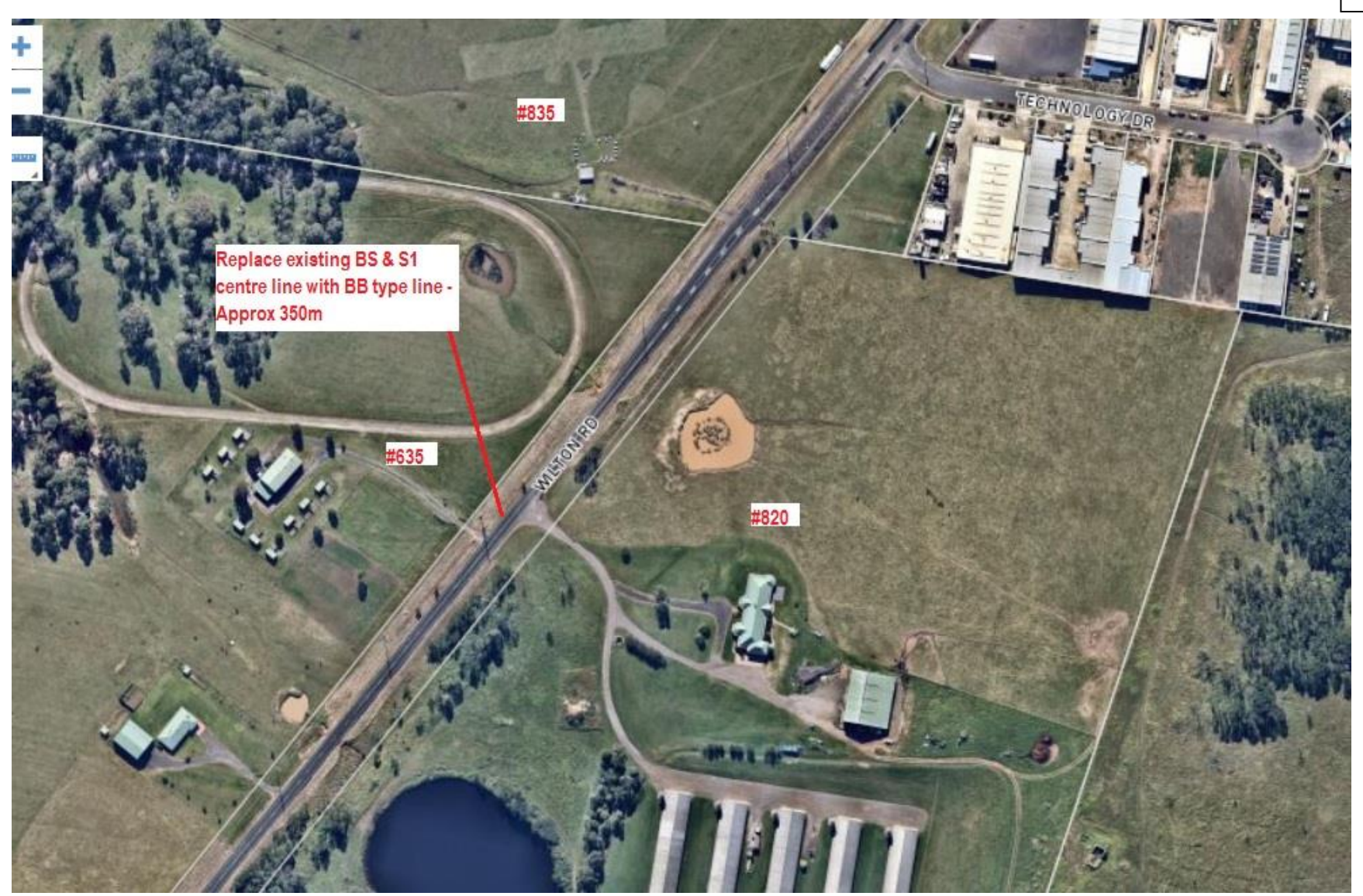
Section of Wilton Road adjacent to # 635