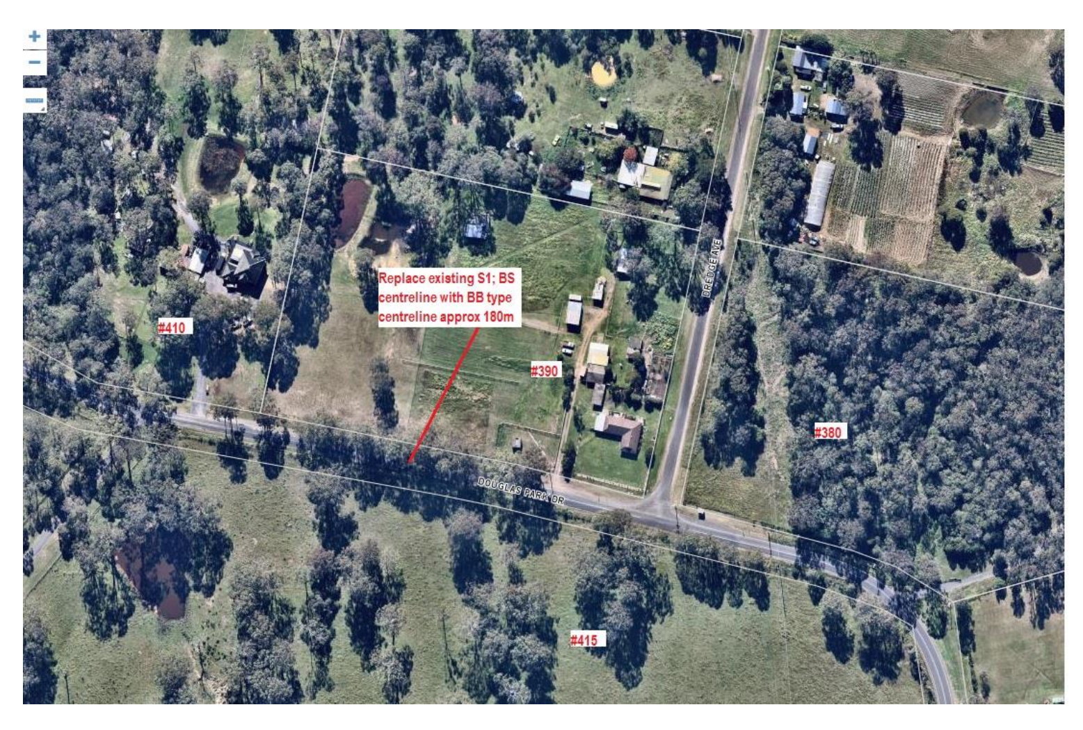
Section of Douglas Park Dr adjacent to # 390