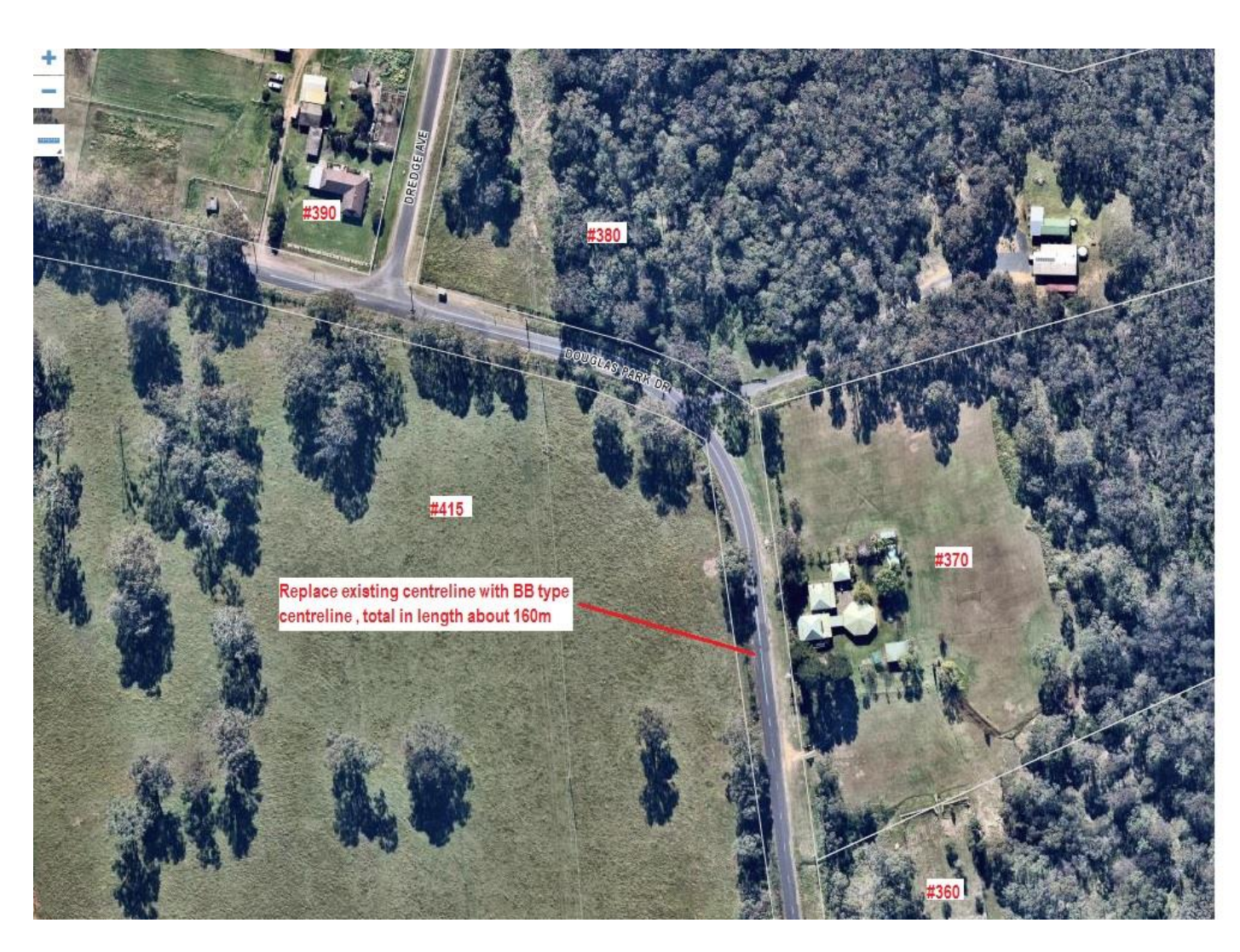
Section of Douglas Park Dr adjacent to # 370