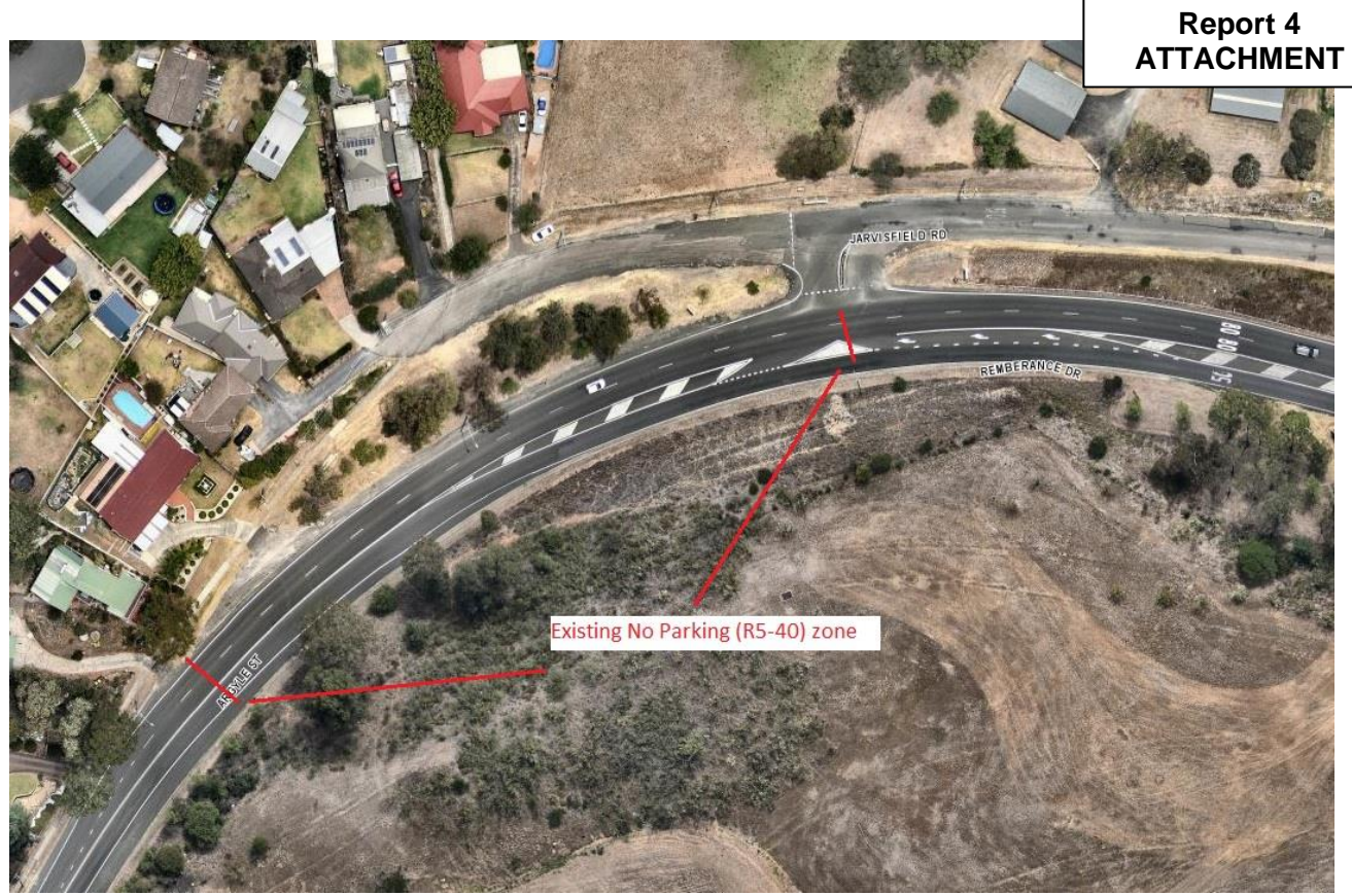
The extent of the existing "No Parking" (R5-40) zone