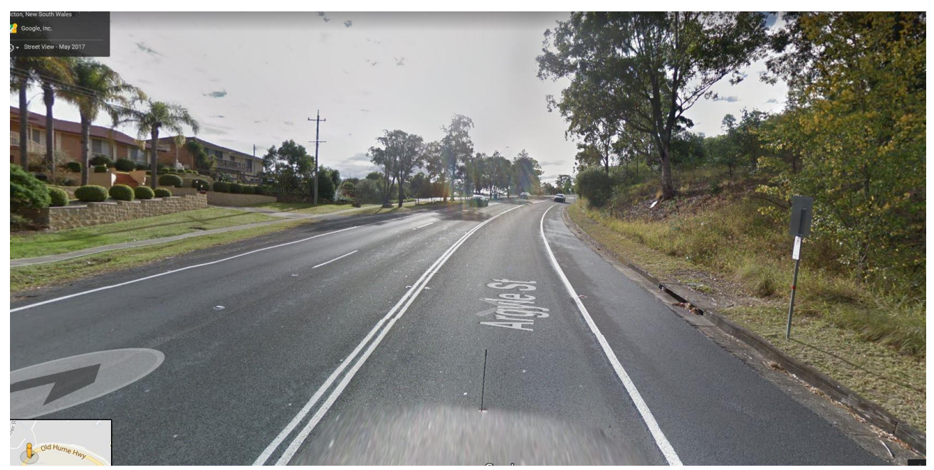
Looking north at the end of the existing "No Parking" (R5-40) zone