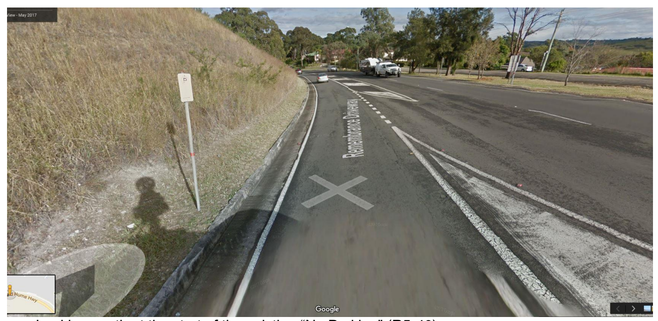
Looking south at the start of the existing "No Parking" (R5-40) zone