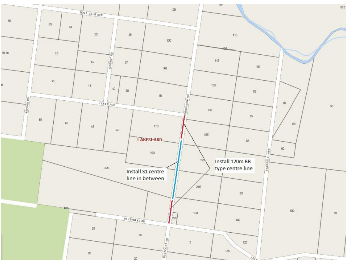
Install new centre line marking from Lynne Avenue to Silvermine Road