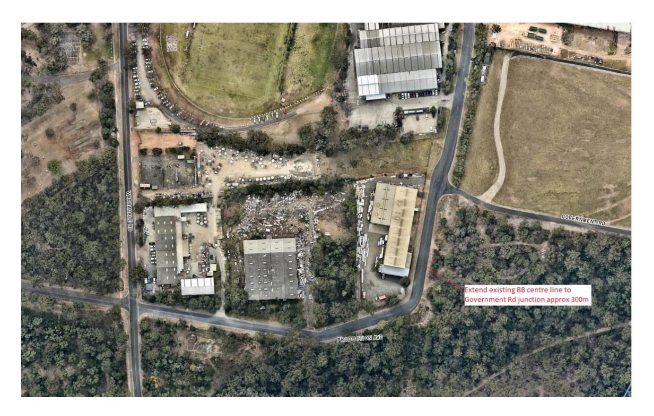
Production Avenue between Warradale Road and Government Road