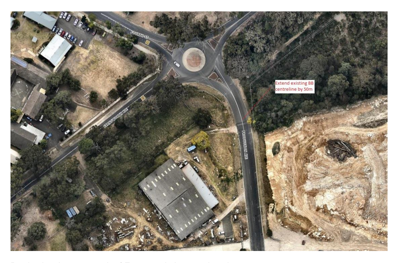
Production Avenue south of Farnsworth Avenue Junction