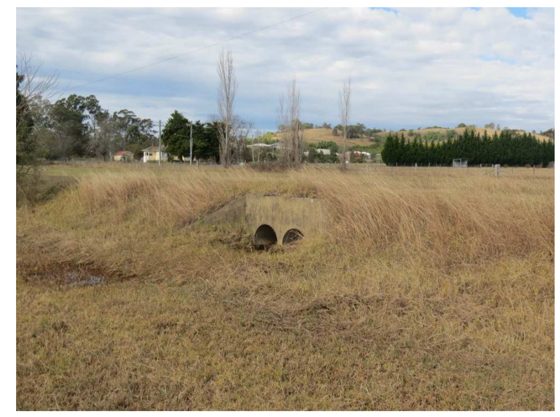
EXISTING CULVERT TO BE RE-USED ON NEW DRIVEWAY (C)