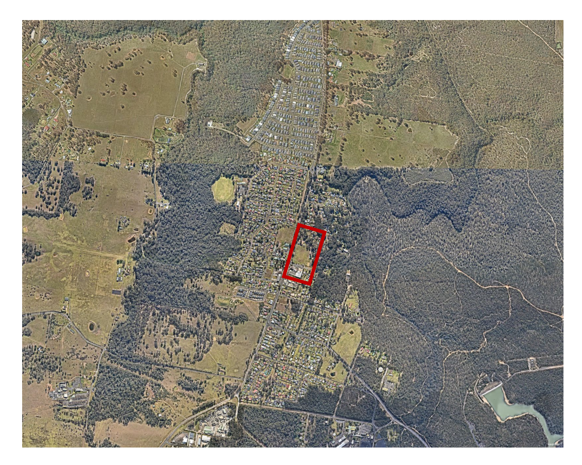
Figure Two: Site Context