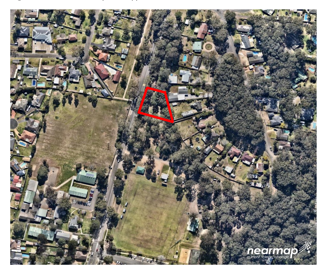
Figure Three: Subject Site